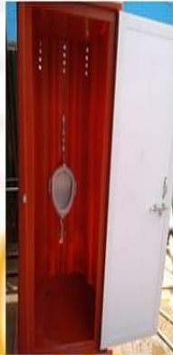
Single URINALS with electrical point