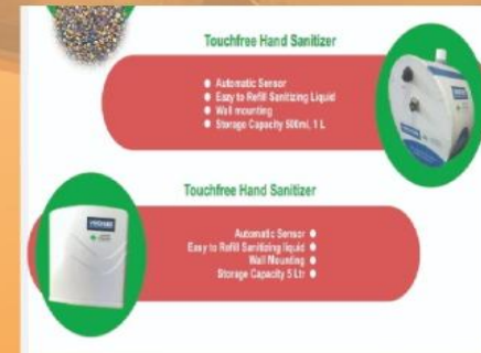
Touchfree Hand Sanitizer