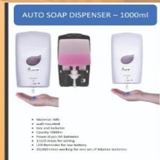
AUTO SOAP DISPENSER – 1000ml