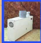
Disinfectant fogging machin