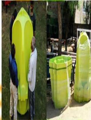
4 WAY URINALS WITH STORAGE TANK OF 400LIT