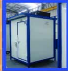
Portable lift & sift structure