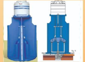
Gents Multiurinals with 200Lit Water Tank