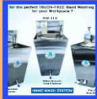
Hand wash station