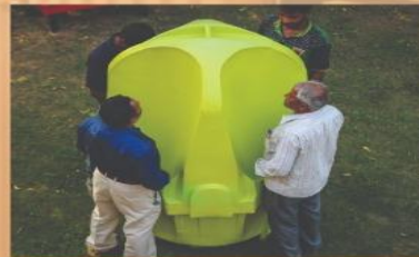
4 Way Urinals with Storage Tank of 400Lit