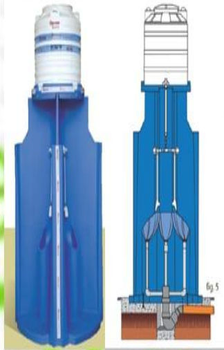
Gents multiurinals with 200lit water Tank