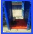
Sanitizer tunnel booth