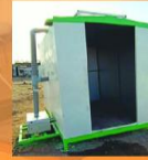
Puf panel tunnel