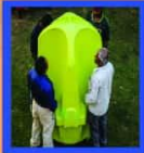
Urinal option for public