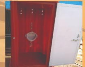
Single Urinals with Electrical Point