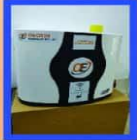
Automatic contactless spray