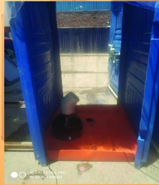
Rotomplded fog tunnel